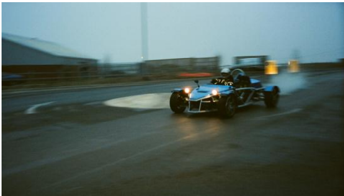
Rocket Zonta leaving MEV workshop