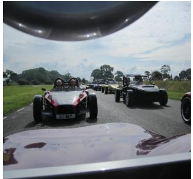
Nice view back through the Exocet roll bar