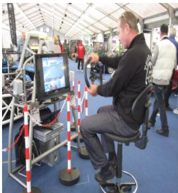
I'm sure there are some components missing from this game!