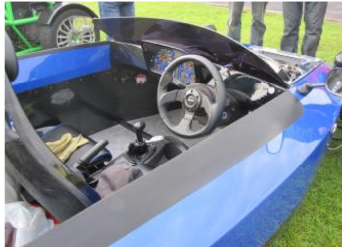
Steve's Uno Turbo powered Sonic7