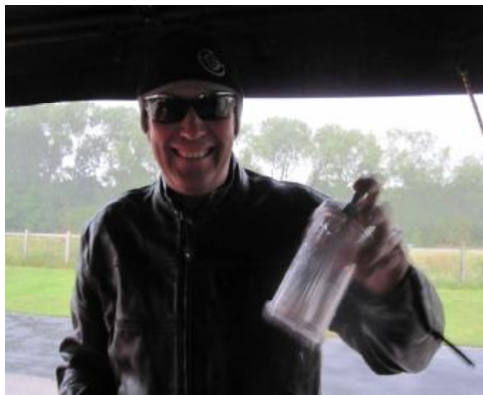
What rain?! This is sugar, and we're not made of it!