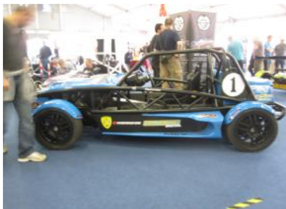
Race Exocet at Detling