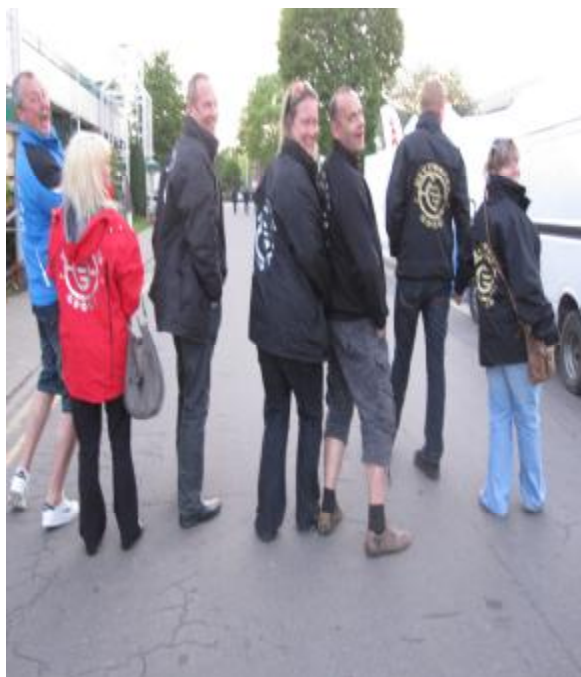
The search party on a beer hunt.....