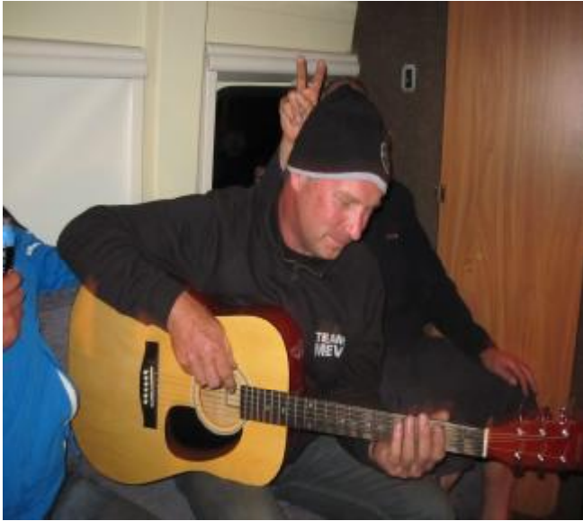
"The Extreme"! playing guitar