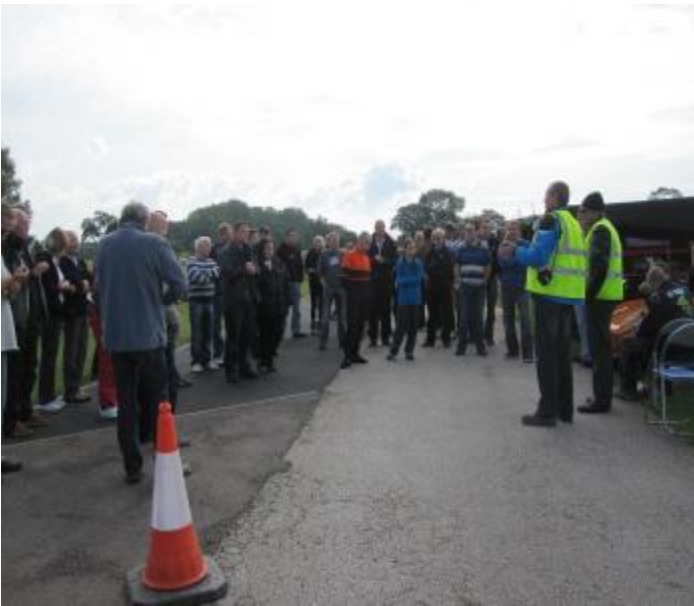
Change of track route at lunchtime, best we tell everybody!!!!