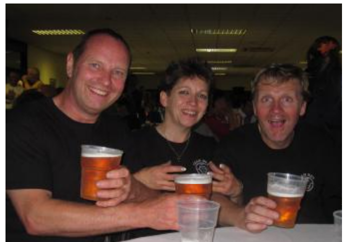
The Extremes getting refreshments after performing songs like "I built my kit car".