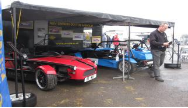
Set up and ready to bring Exocet to a new audience