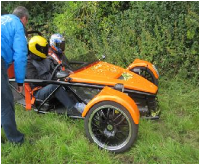
Lego's flymo after being pulled from hedge