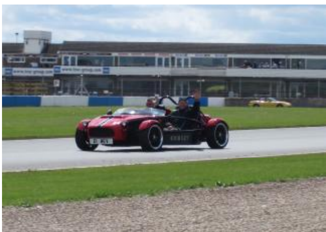
Exocet on a lap of Donington