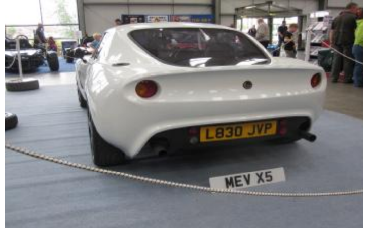
The new MEVX5