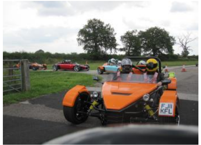
A few more laps before finishing