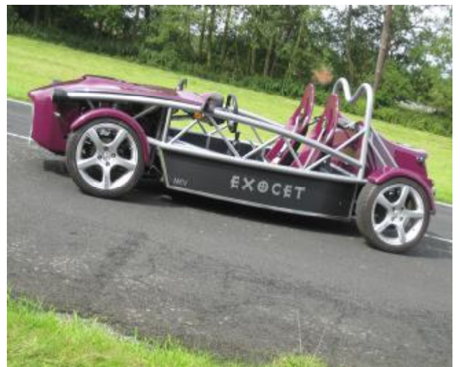
One completed purple and silver Exocet!