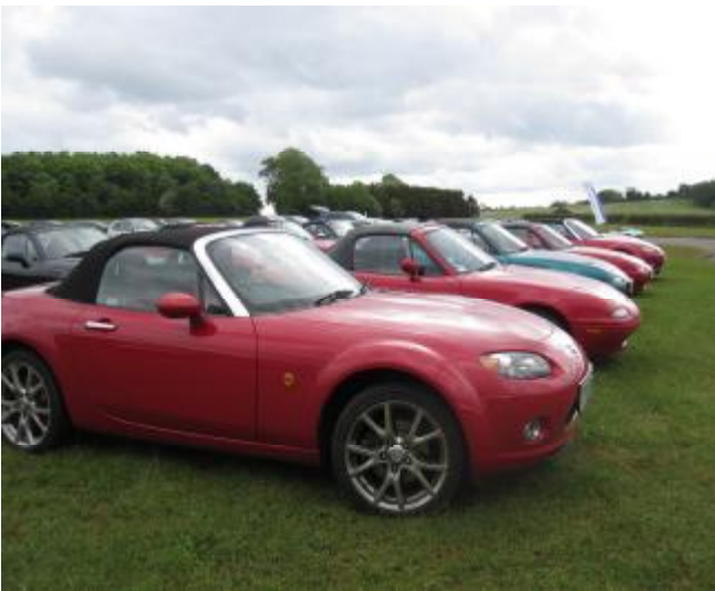
Exocet donors in waiting!!!!