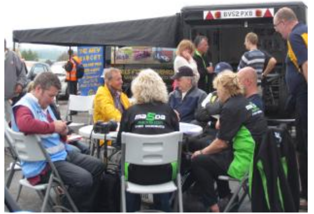
Members of Ma5da Racing