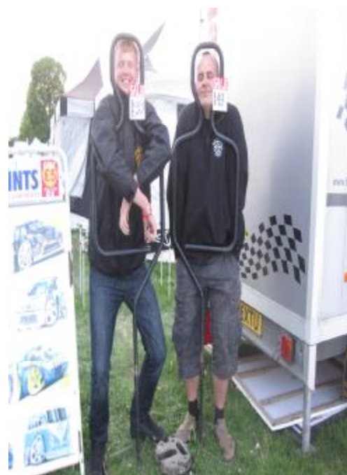
Debs snapped up two Moggers on sale!