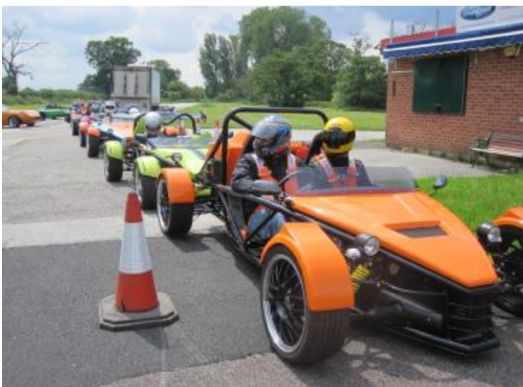
After the meeting..... we had some meat in! Oh and a few beers.