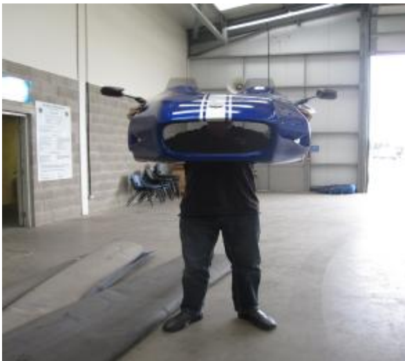
tR1ke man was spotted in the hall!