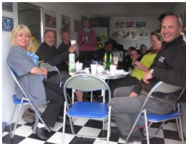
.....and inside for fish and chips!