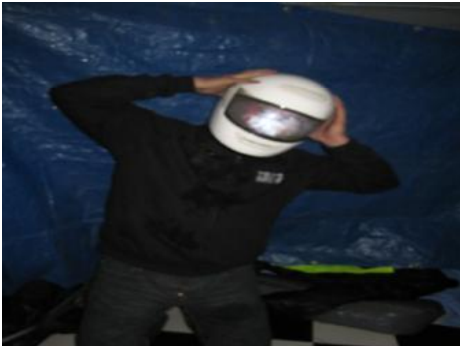
"aagh, I can feel another car breaking out of here"!!