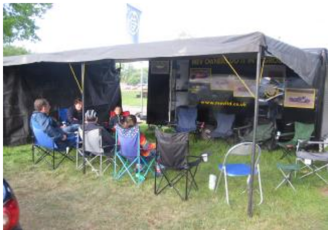
The MEV Hostility awning proved popular to owners escaping the breeze.