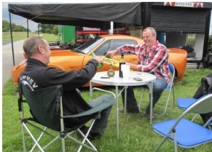
Friday afternoon, set up ready..... time to relax for a while