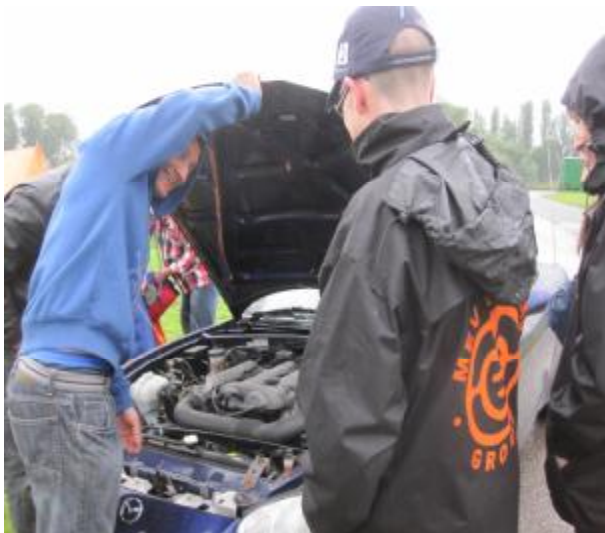
We can have this stripped before Nigel gets back from the pub!