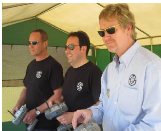
Some radio controlled racing.....and some chair racing!!!